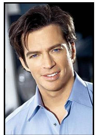
Harry Connick, Jr.

THURSDAY, NOVEMBER 17 – With a free day to enjoy New York as you please, you may take advantage of the wonderful shopping on legendary Madison and Fifth Avenues not far from our hotel; roam one of the world-class museums; or just take a long walk absorbing the sights and sounds of our nation's most famous city. Need some ideas on what to see and do? Your tour escorts are available to offer a multitude of suggestions and expert guidance. Tonight we rendezvous at our theatre venue. Love blooms in unexpected places in the delightfully re-imagined world of " On a Clear Day You Can See Forever ." Still in love with his deceased wife, a dashing psychiatrist and professor (heart throb and just plain great musical theatre actor, Harry Connick, Jr.) unknowingly takes on the case of his life with a quirky young florists' assistant. While putting him under hypnosis, the Doctor stumbles upon what he believes to be the man's former self — a dazzling and self-possessed 1940s jazz singer Melinda Wells. Instantly intrigued by Melinda, the Doctor finds himself swept up in the pursuit of an irresistible (and impossible) love affair with this woman from another time and place, who may or may not have ever existed! Making the case for living life with your eyes and heart wide open, the show's score includes, "Come Back To Me," "What Did I Have That I Don't Have Now?" and the titular, "On A Clear Day You Can See Forever." Our hotel is just a short walk across Broadway.