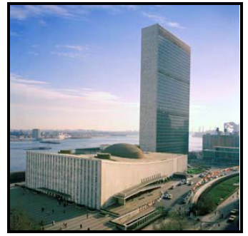
United Nations Headquarters along the East River in Manhattan

FRIDAY, NOVEMBER 18 – You may enjoy another day in New York on your own. But for those who have chosen our Optional Morning Tour , we depart from the hotel by private motorcoach for a rare treat. Standing on the eastern shore of Manhattan island, on the banks of New York City's East River, United Nations Headquarters remains both a symbol of peace and a beacon of hope. To its 18 acres – declared international territory – come representatives of the earth's six billion people to discuss and decide issues of peace and justice, as well as economic and social well being. With our international docent, who will be expecting to answer our many questions, we will take a privately guided tour. Among the highlights of our walk is planned a visit to the General Assembly Room, the largest meeting room at the United Nations where the 193 members of the Organization convene to discuss global issues. Then, tour members will be led into the Delegate's Dining Room to enjoy a panoramic view of the East River, a hearty lunch and a chat about the day's event. Afterwards, our