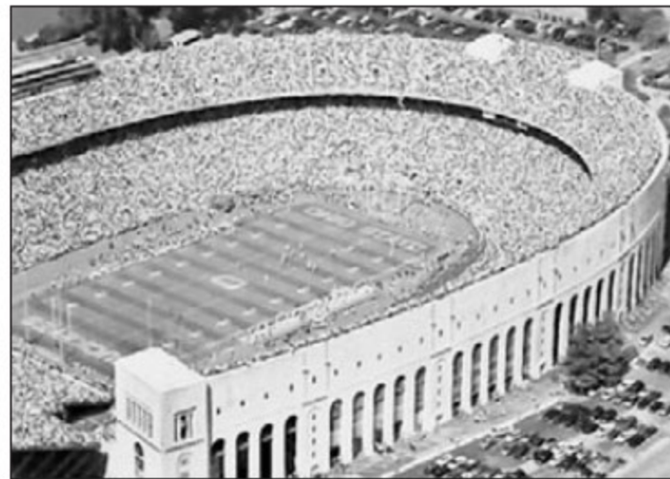
Ohio State, Penn State and Michigan regularly draw crowds of 100,000 plus in the fall.