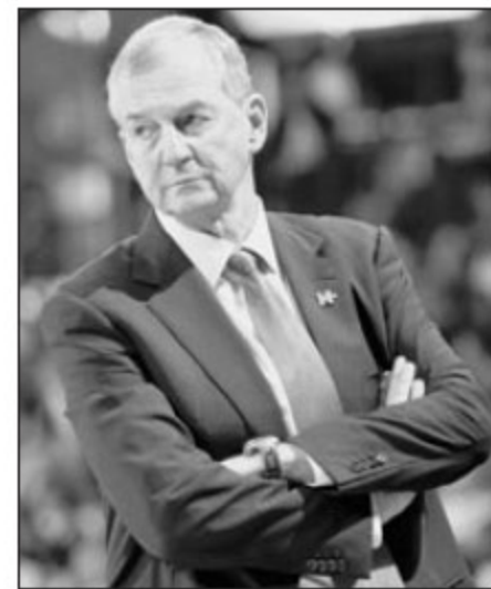
Jim Calhoun's basketball team helps make UConn No. 1.